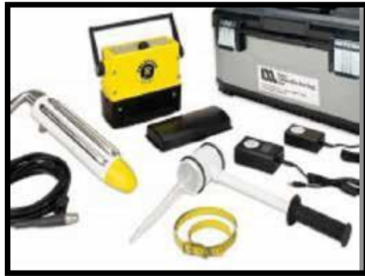
Figure 3 Electro-ejaculator (EEJ) machine