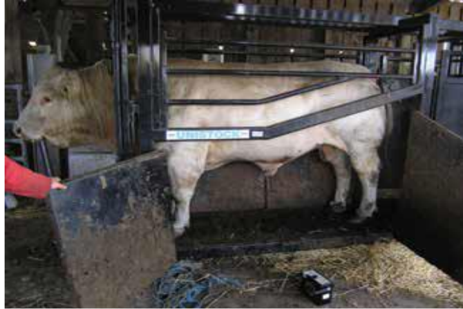
Figure 1 Restriction of the bull before the examination